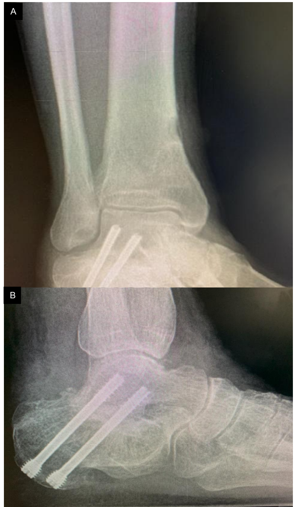
EXHIBIT 9 :: A) 12 week post-operative AP radiograph showing bone harvest site reincorporation B) 12 week lateral radiograph showing arthrodesis at the fusion site