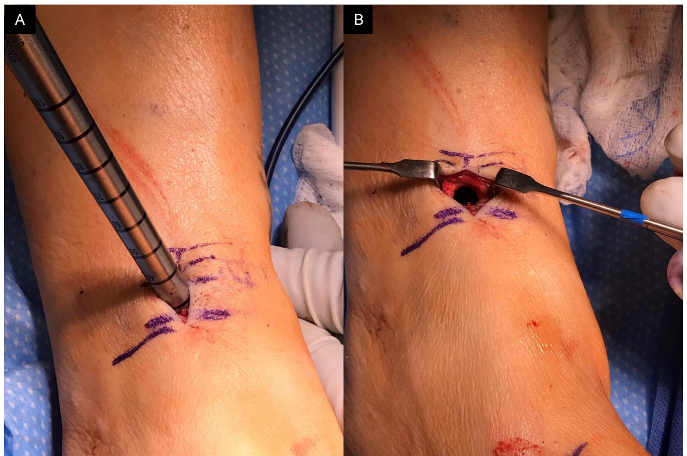
EXHIBIT 6 :: A) Depth markings on the device provide feedback in addition to tactile feedback of the cutting element of the Avitus® Bone Harvester. B) Sterile saline is used to flush the harvest site out post-harvest.