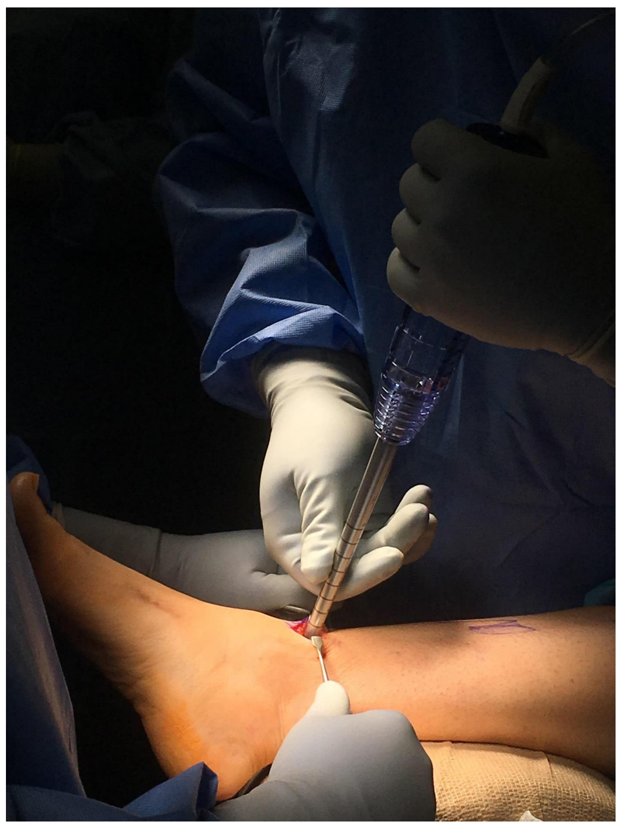
EXHIBIT 3 :: The Avitus® Bone Harvester inserted into the cortical entry of the distal tibia metaphysis.