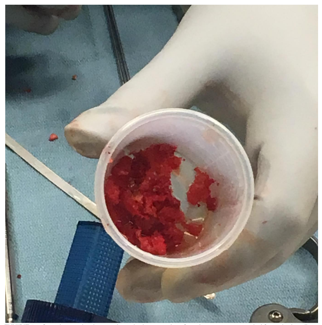
EXHIBIT 5 :: Once harvesting is complete, the harvested graft and marrow are emptied from the handle of the Avitus<sup>®</sup> Bone Harvester. Pictured here is 15cc of cancellous bone retrieved from the device.